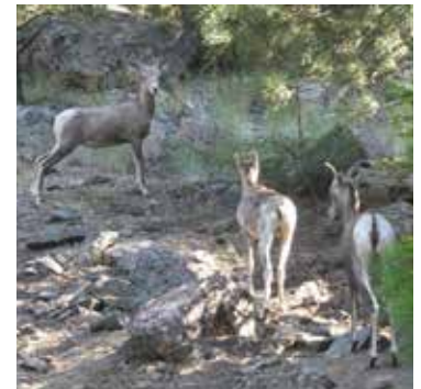
Rocky Mountain Big Horn sheep