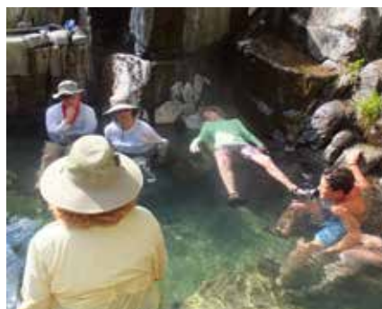
Relaxing in a natural hot springs