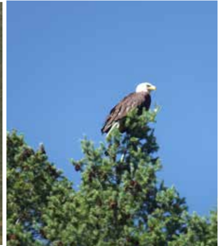
A bald eagle observes our flotilla