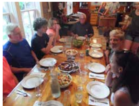
Dining in the wilderness