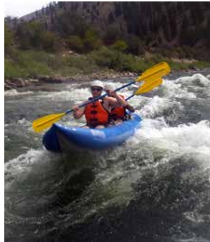
Another rapid successfully run