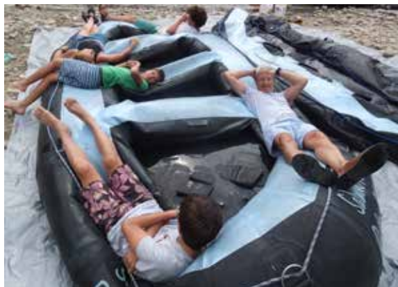
Trip participants help deflate the rafts at the end of the trip