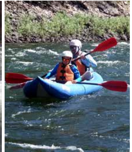
Father - son kayak team