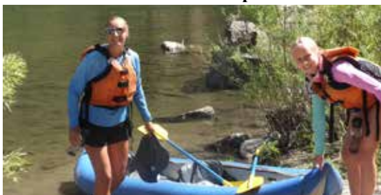
Mother - daughter kayak team